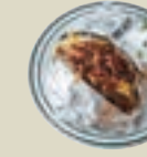
Loaded Baked Potato add $2