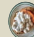
Loaded Sweet Potato add $2